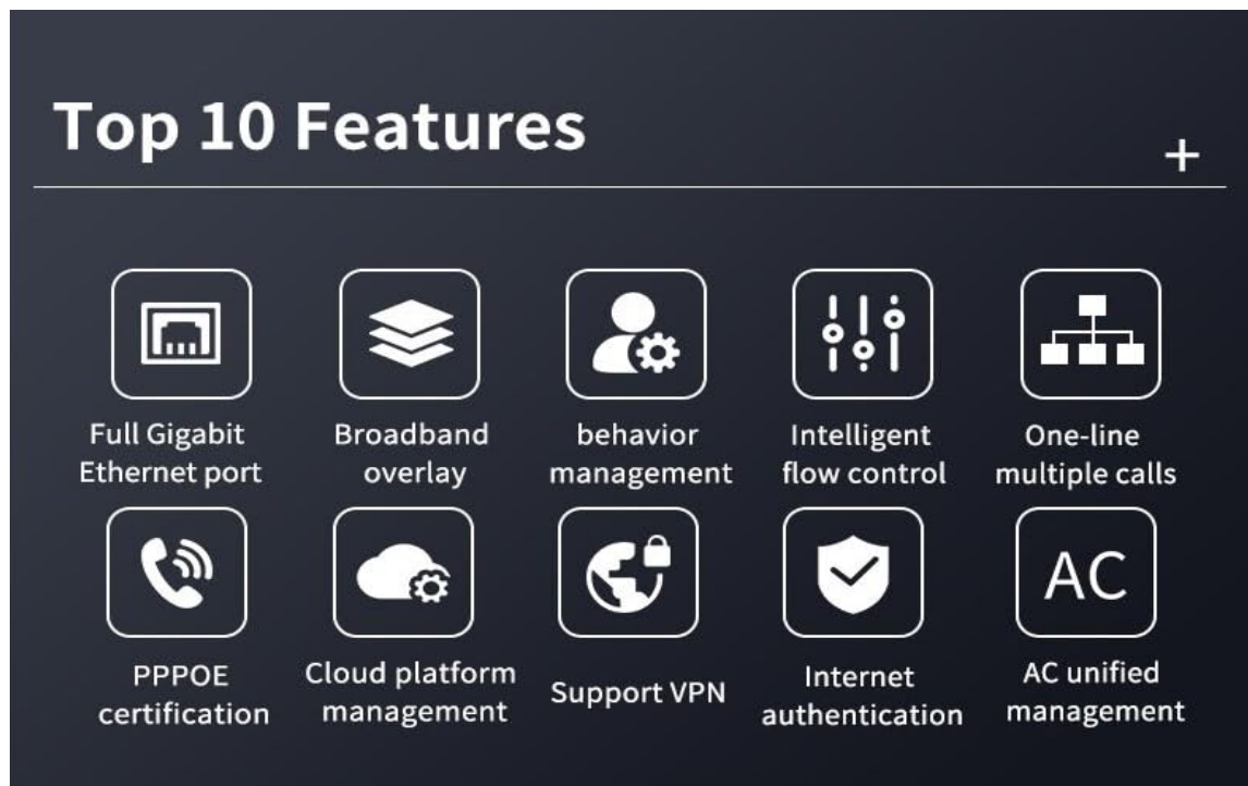
Image3 – Vnetwall 400H Firewall Features